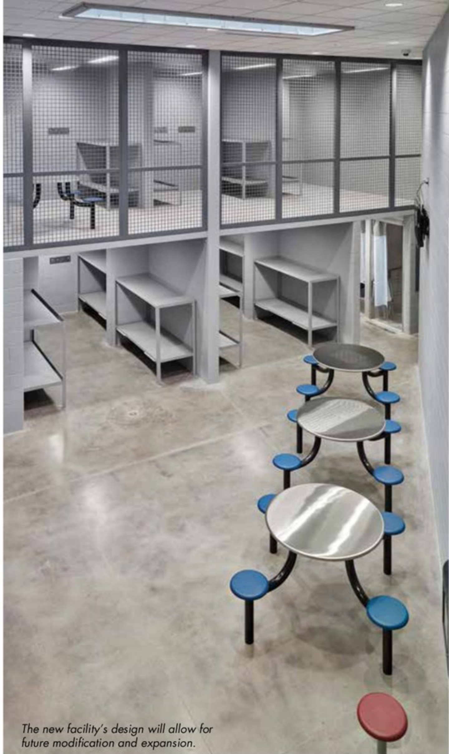
The new facility's design will allow for future modification and expansion.