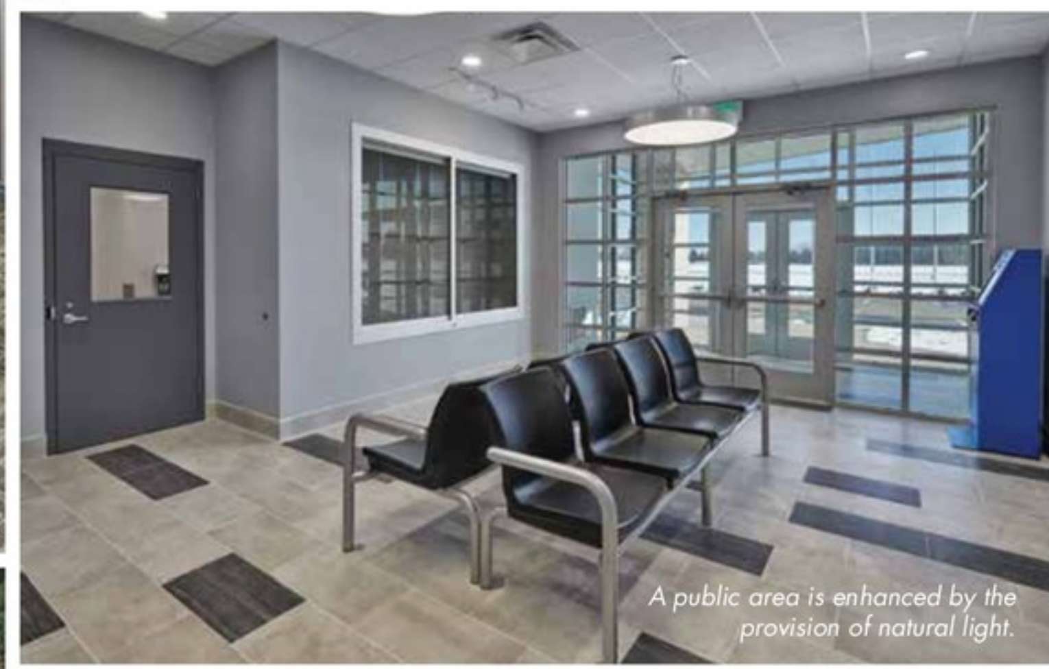
A public area is enhanced by the provision of natural light.