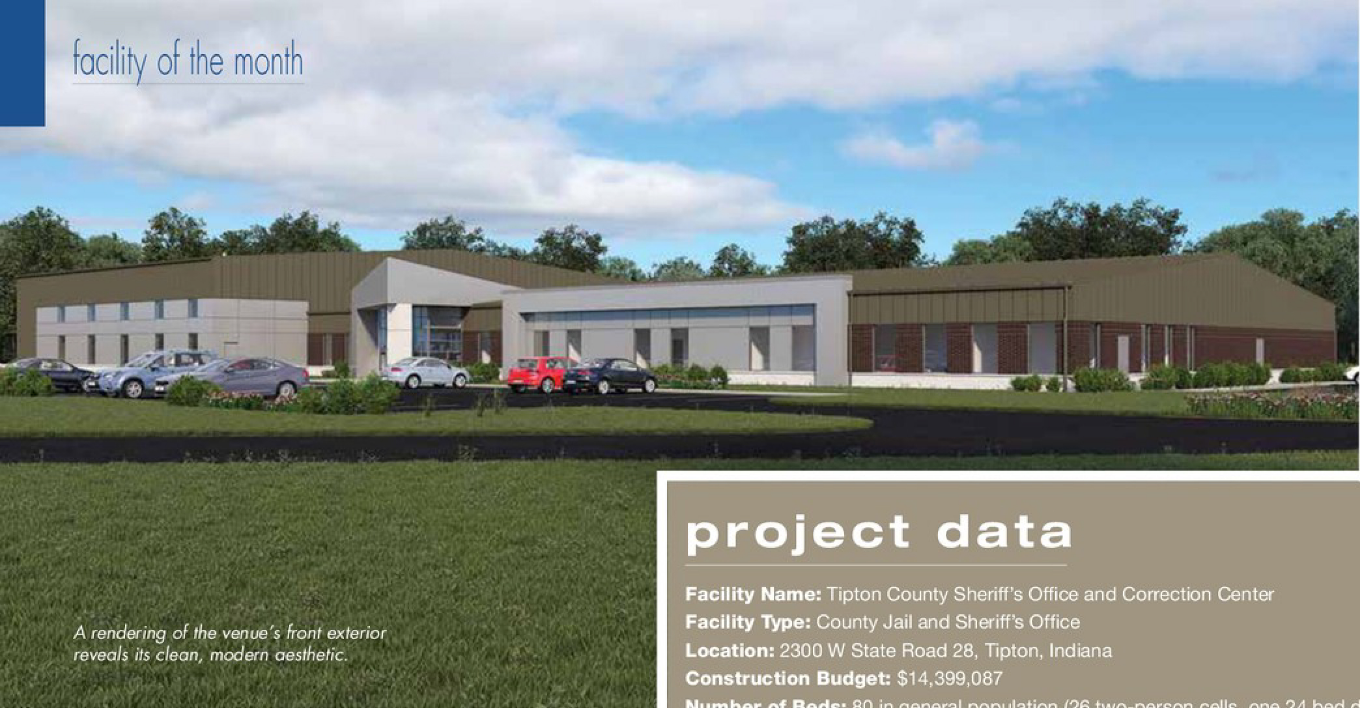
A rendering of the venue's front exterior reveals its clean, modern aesthetic.