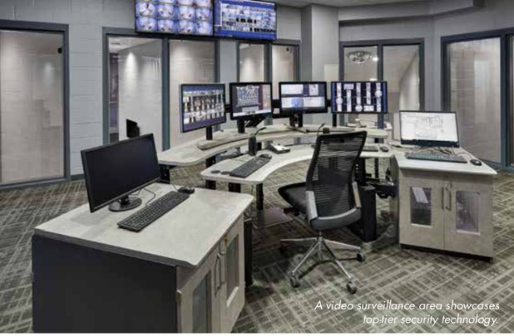
A video surveillance area showcases top-tier security technology.